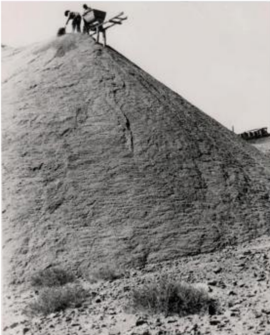
Prieska tailings dump. After the plant closed, the tailings were removed and retreated at Joyner's Stofbakkies operation across the Orange River