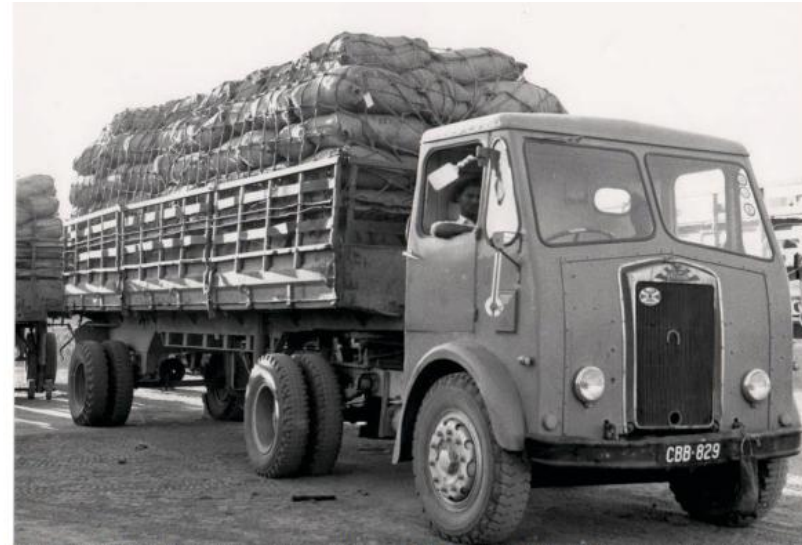
Fully loaded Albion lorry and trailer ready to depart from Koegas, 25 km from Draghoender Station Gefco was mining at Pries, Mt Vera, Whitewack, Ooradja, Elders (Maroon) and