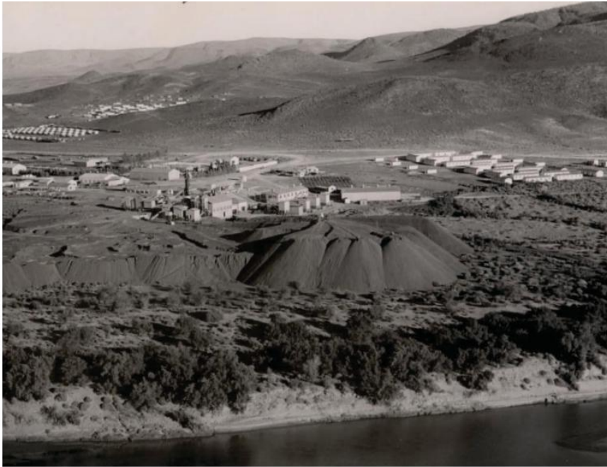
Westerberg Mine, across the Orange River from above Koegas, and looking over tailings dumps