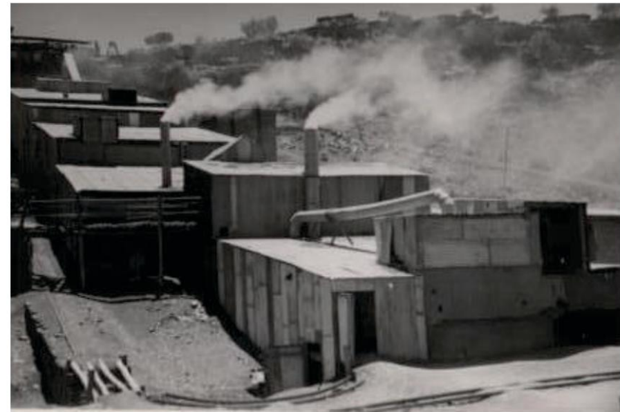
Typical discharge to atmosphere from an older plant. ('Klipvlei' written on the back of the photograph)